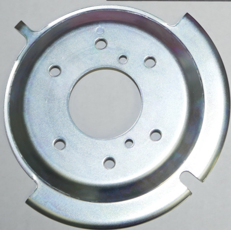
PART # 97367477 2 PIECE CAM GEAR