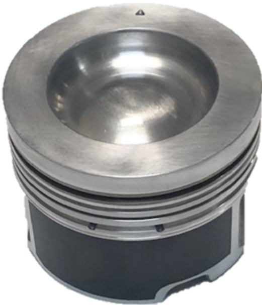
Mahle Motor Sport