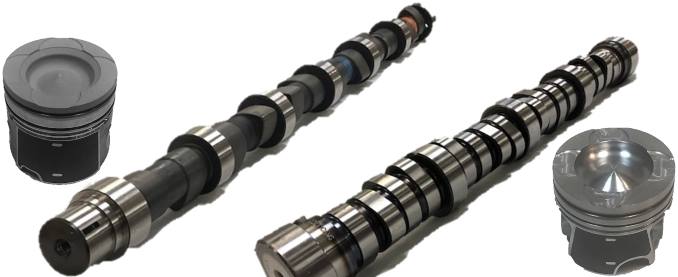
Inline 6 Cylinder Upgraded Camshaft & Valve Relief