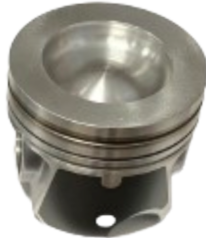
Heavy Duty Upgrade